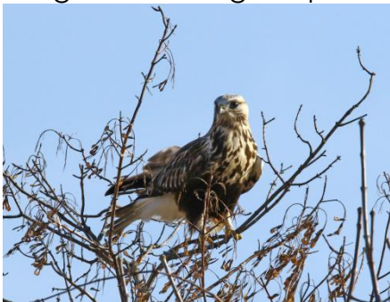
Rough legged Hawk